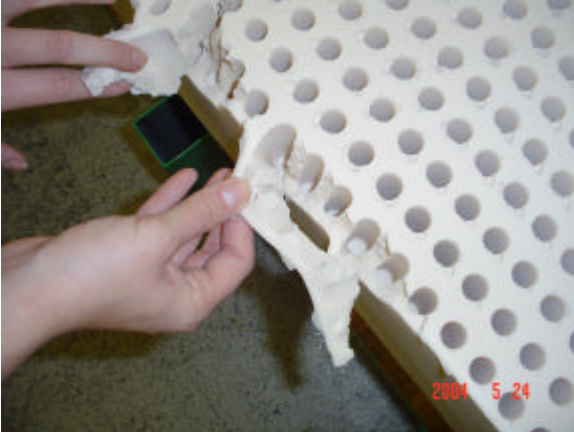
Unacceptable: Torn Edge