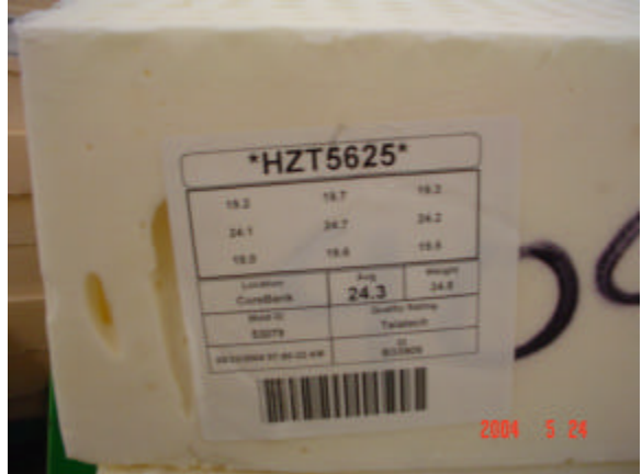
Unacceptable: Label not square

Authorization & Date: COMPANY CONFIDENTIAL PROPERTY OF LATEX FOAM INTERNATIONAL, LLC, SHELTON, CT